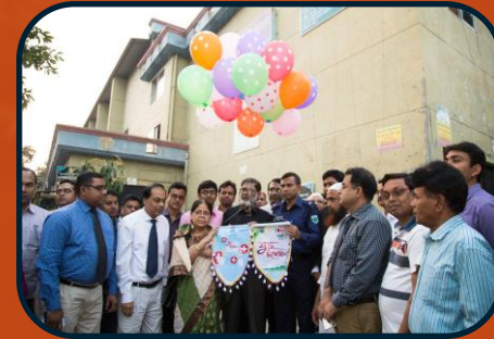
Food, Agro & Health Expo