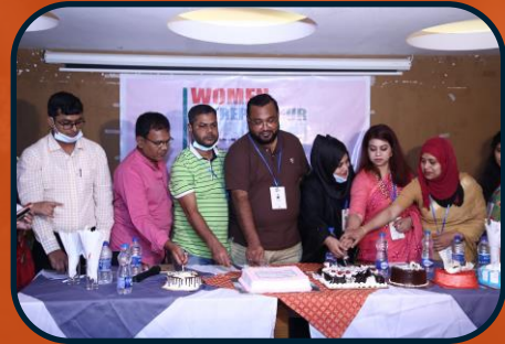
Women Entrepreneurship Development Camp