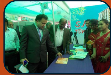
Housing Industry Fair