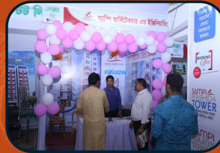
Housing Industry Fair