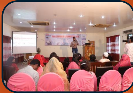
Young Entrepreneur Development