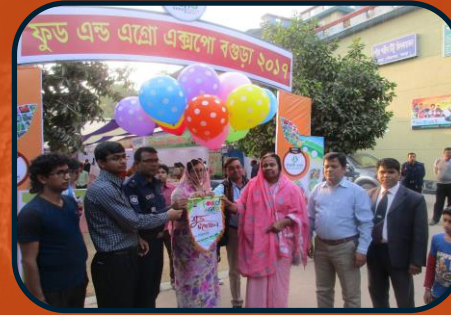
Food & Agro Expo